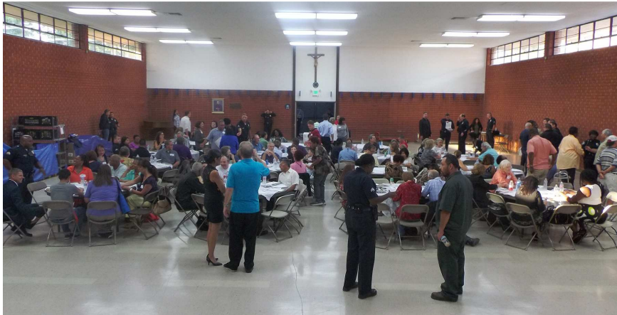
Our Lady of Peace Church · 15444 Nordhoff Street · North Hills, CA 91343