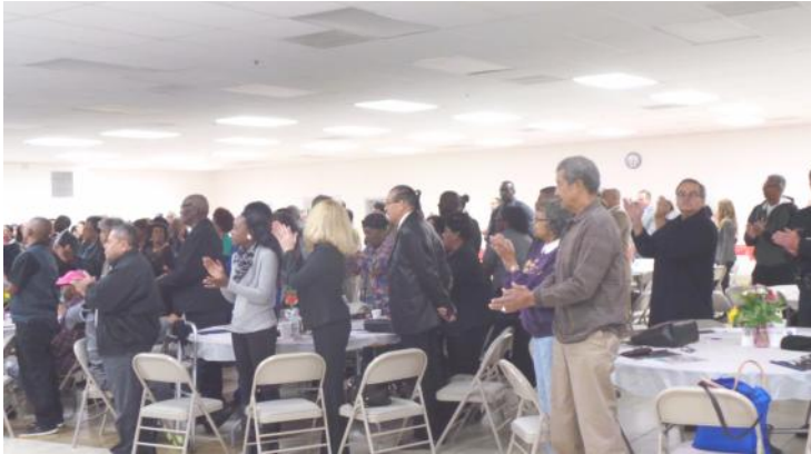
A large audience was on hand to listen to the top ranking LA officials talk about law enforcement and the criminal justice system.