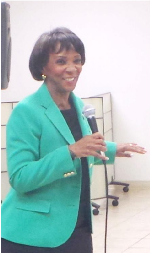
Ms. Lacey is the first African American and first female to serve in the office of LA County District Attorney.