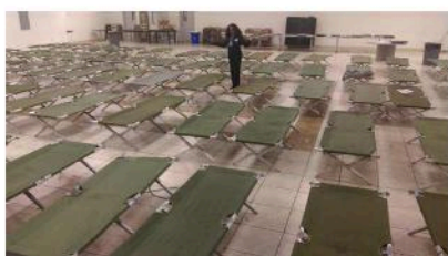
There are approximately 135 cots that provide a warm place to sleep for homeless people at the church facility located next to the main sanctuary. This temporary winter shelter only accommodates single individuals overnight. They must leave the premises the next morning but may return in the evening.