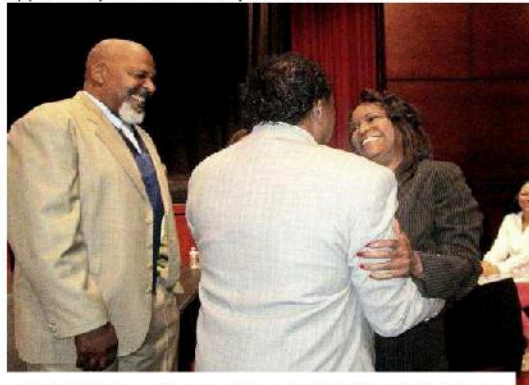
Guests arrive. Coffee, juice, fruit and pastries were available before the Town Hall meeting started.

This was a significant event happening in the SFV.