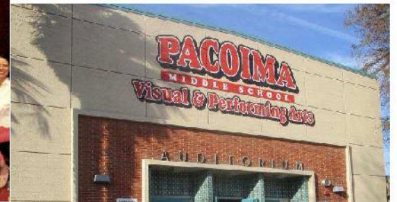
The Pacoima Singers Musical Theater Group is an award-winning multiethnic performing arts group at the Pacoima Middle School Performing Arts Magnet. They provided entertainment for the event.