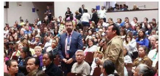
The audience had an opportunity to ask questions both in English and Spanish and translations went quickly and smoothly. The questions covered a range of subjects including an emotional plea for more safety measures from a parent whose son was killed leaving San Fernando High School. For those parents who had specific questions about a particular school, LAUSD staff were on hand to speak with that parent one-on-one.