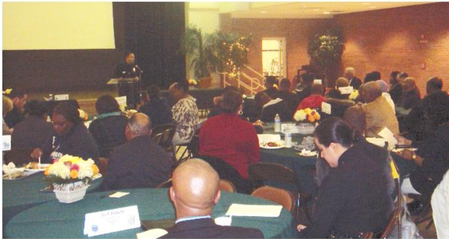
November 21, 2013. A large group of community members gathered at the St. John Baptist De La Salle Church in Granada Hills to discuss topics related to the LAPD and the African American community in the San Fernando Valley.

This was an opportunity for the community to give feedback, ask questions and tell the LAPD what's important to community members.