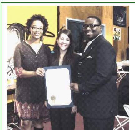
The Mayor's Award