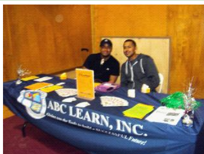
ABC Learn, Inc.