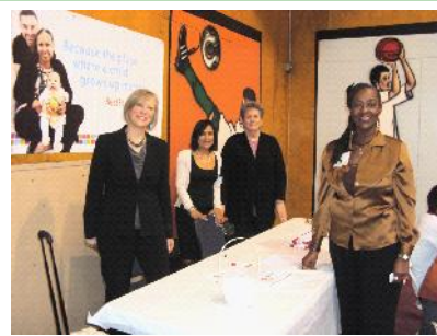
First 5/BestStart LA