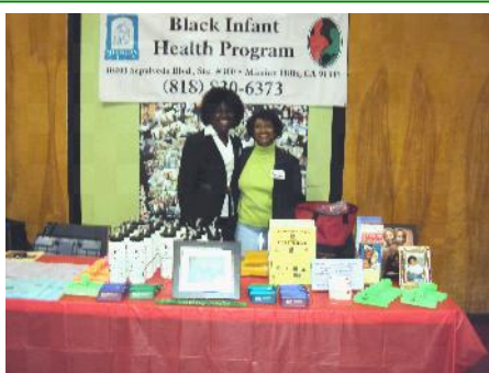
MCCN-Black Infant Health